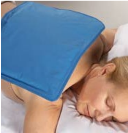
Standard Size Pad #61035 (61030) For Back, Hip, Shoulder Includes securing wrap