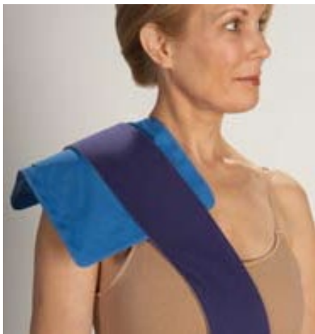
Half Size Pad #61025 (61020) For Shoulder, Back, Legs Includes securing wrap